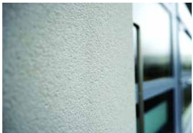
Firhill Secondary School, Edinburgh