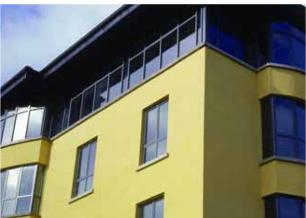
Park Hotel, Mullingar

Our 'Traditional Choice' range of hydraulic lime mortars and renders is produced to the same high standards as our cement based products. Ideal for heritage projects, whether refurbishment or new build. Further details available on request.