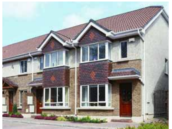
Ashtown Residential Development, Co. Dublin