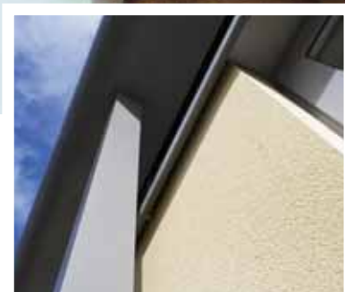
Bonnyrigg Health Centre, Edinburgh

Now, following intensive research and product development, we have expanded our range to include high performance renders, offering the same high standards of quality and service. EuroMix Renders already have a track record of success on prestige projects. Our unrivalled technical know-how and expertise, combined with the uniquely personal service of our sales and customer service personnel, result in an unbeatable package.