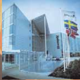
Radisson SAS Hotel, Stansted Airport, London