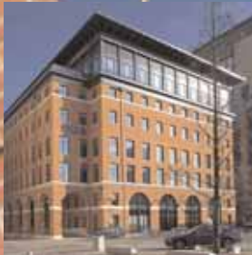
Brindley Place, Birmingham