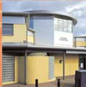
Bonnyrigg Medical Centre, Edinburgh