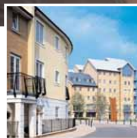
Port Marine, Portishead