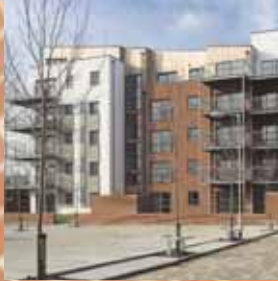
South at Didsbury Point, Didsbury