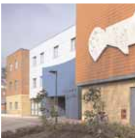
Nuffield Hospital, Oxford