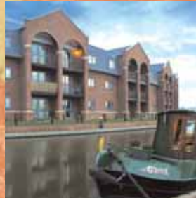
Cameron Wharf, Stone