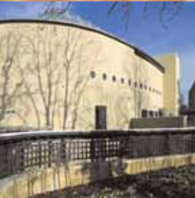
Oxford University, Sports & Social Club