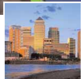
Canary Wharf, London