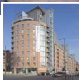
The Hacienda Apartments, Manchester