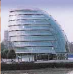
GLA building, London