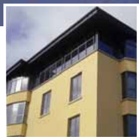
The Park Hotel, Mullingar