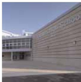
Chorlton High School, Manchester